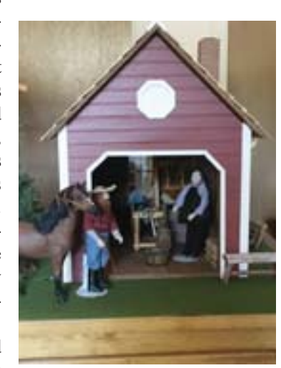
The inside of Centerville's blacksmith shop.

"I have a need to do crafty-type things," she noted and now does more scrapbooking and card making. "Time really flies when I'm working on these projects."